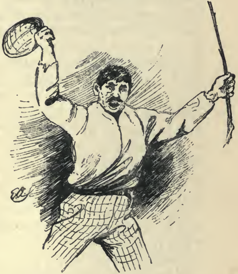
"'SKELP HER, YE BIG BRUTE!' SAYS I"

"'Hah!' says I, givin' her a couple o' dhraws